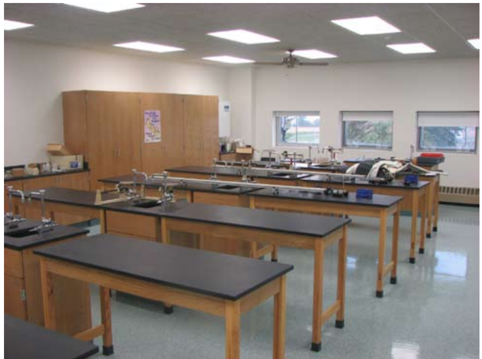
New science lab at the West Bend-Mallard Community High School.

The West Bend community demonstrated its commitment to its youth by investing in a number of significant health and safety upgrades to its school